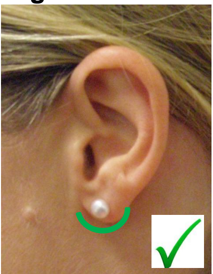
Fig 2 detached