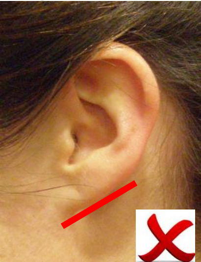
Fig 3 attached